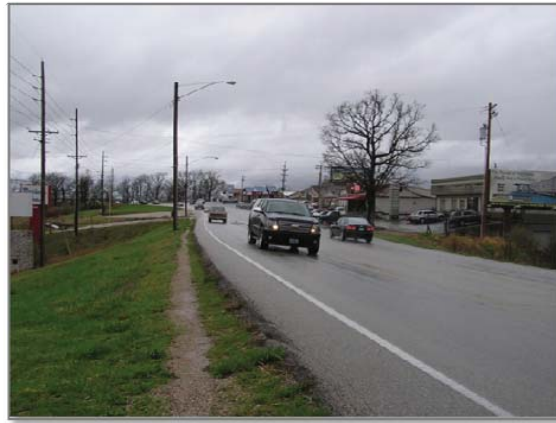
Figure A-31: Informal “Goat Path”

The City of Camdenton is working with MoDOT on some sidewalk updates along MO-5 in the downtown area. They are working through a federal enhancement grant program to improve pedestrian accommodations on the west side of MO-5 between Benne Boulevard and Ha Ha Tonka Cut Thru (will tie in with the sidewalks in front of the courthouse) and on the east side of MO-5 between Kansas Street and Laker Drive (will tie in with a connection to the school). The City also commented that many residents have expressed some type of concern or suggestion for a future sidewalk between the square, also known as State US-54 and MO-5, and the Walmart located about 1.5 miles north along US-54 just south of Route V. Apparently there is a desire for a lot of pedestrian traffic along this section of highway and sidewalks or a multi-use trail would prove to be beneficial.