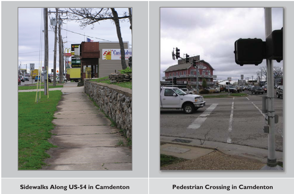
Sidewalks Along US-54 in Camdenton