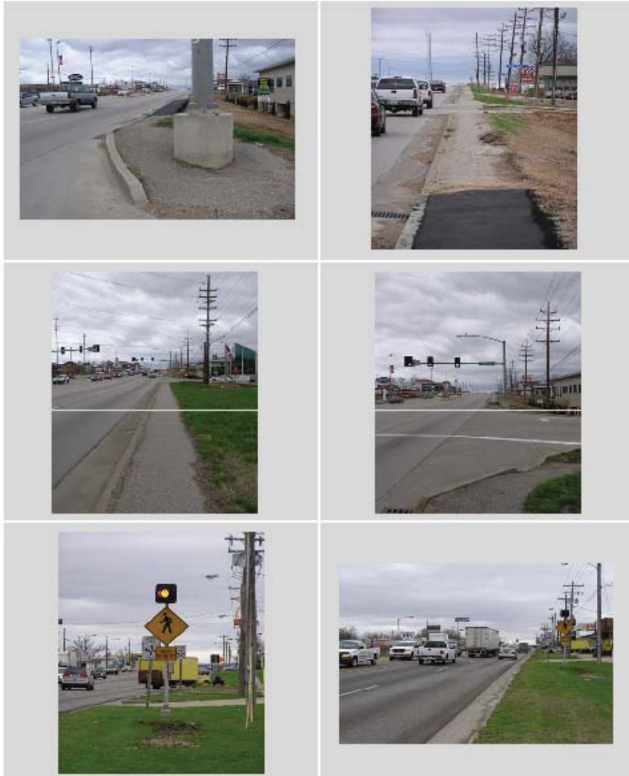
Figure A-30: Examples of ‘Ad-Hoc’ Bicycle and Pedestrian Facilities

Many “ad-hoc” bicycle and pedestrian facilities are found throughout the Lake Area. For example, the paved shoulders along US-54 are being used as sidewalks, even though these facilities clearly do not meet ADA standards. Also, pedestrian crossing warning signs have been emplaced on US-54 near Camdenton as a result of past safety issues. However, this crossing clearly does not provide for safe pedestrian crossings.