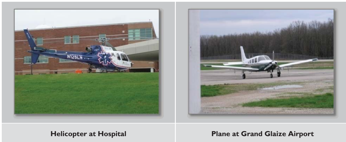
Helicopter at Hospital