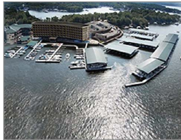
Figure A-32: Horny Toad Marina

The Lake offers a unique type of trail to the area, a scenic aquatic trail. This trail is administered by the Missouri Department of Natural Resources as part of the Lake of the Ozarks State Park. This trail is nine miles long and runs from the Lake’s east end northwest to the Grand Glaize Beach. A map is available at the park office. There are 14 stops along the trail, each marked with an orange and white buoy, listed in Figure A-33 26 .