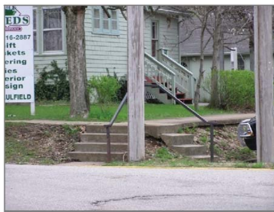
Figure A-29: Sidewalks Ending in Steps

Outdated pedestrian facilities are found throughout the Lake Area. These facilities are paved sidewalks but have ADA issues. Most of these facilities were built years ago before the current standards for disabled persons were established.